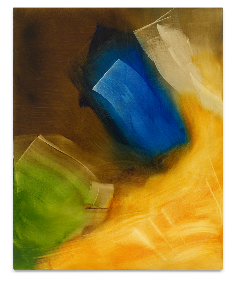
Elise Ansel, Crop II , 2023. Oil on linen, 40 x 32 inches. Courtesy the artist and Miles McEnery.

Tracking Ansel's manipulation of blue in this show would be an experiment in the perception of hues. A painting like Crop II (2023), 40 by 32 inches, is almost a still life, but the only discernible object is a blue rectangle: color transformed into an artifact, as if to tell us that Elise Ansel has reached a new height in this show, that her work is self-reflective, self-contained, the expression of her own high-powered imagination.