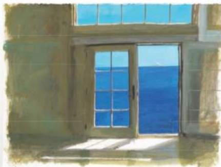
5 High Tide , gouache on paper, 22½ x 30"