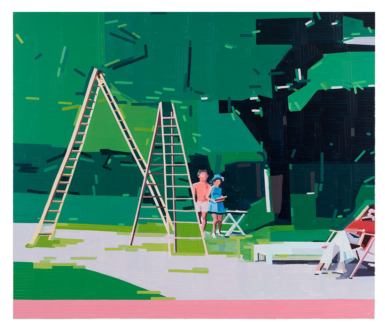
Guy Yanai, Lake Annecy (Claire's Knee) (2019)