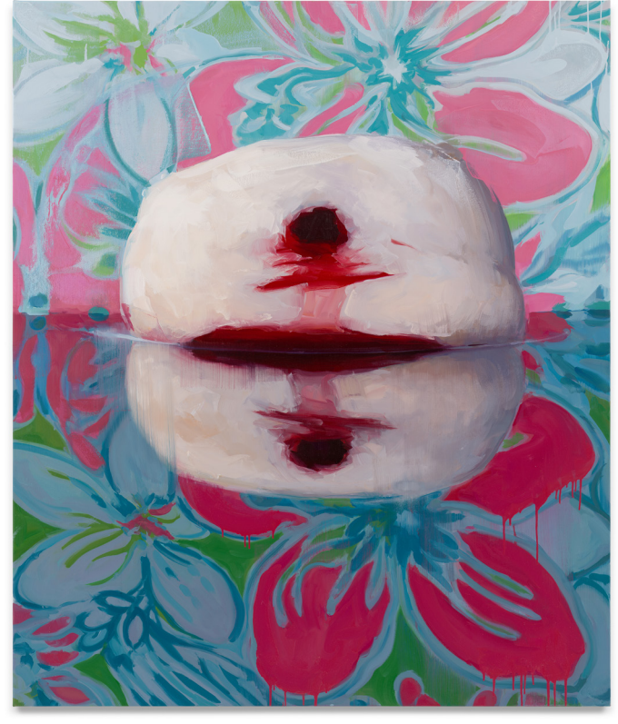
Diary of a Thief, 2023, Oil on canvas, 58 x 49 inches