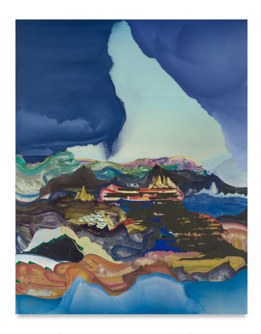
Elliott Green, Heavy Shit in Candy-Land, 2019, Oil on linen, 90 \times 70 inches, 228.6 \times 177.8 cm

YOU AGAIN adopts its title and narrative structure from Debra Jo Immergut's 2020 novel You Again, the story of a protagonist painter in contemporary New York City encountering a person who resiliently appears as her younger artist self from the 1990s. As with the novel, YOU AGAIN stretches linear time into a contemporary elastic, plastic and porous shape, space, and dimension. Recursive signs transform a point in time to a reflexive, uncontainable quality and quantity.